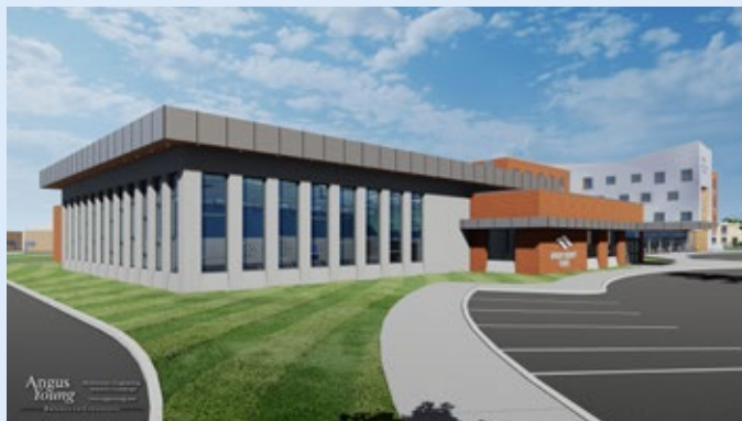
Entrance to the Aquatic Therapy Pool