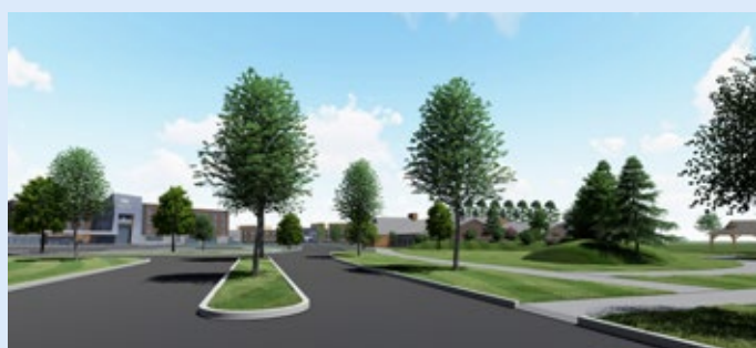
Front view from Marshall Street