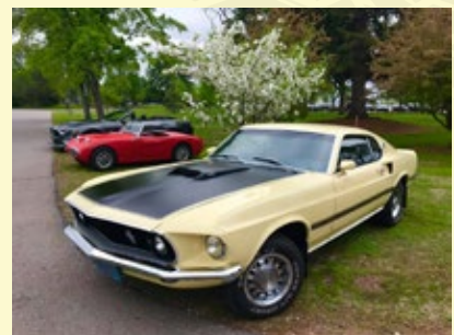
Just some of the vehicles on display at the Mount View Care Center's Annual Classic Car Show, June 4th