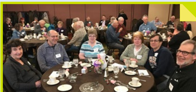
Volunteer Breakfast 2019 at the Holiday Inn & Suites in Rothschild