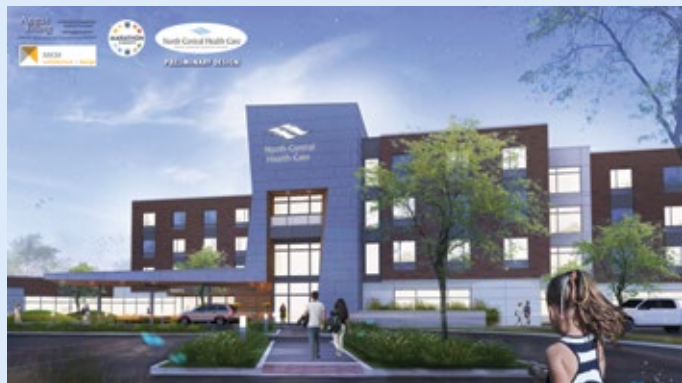
Front main entrance to Mount View Care Center and Bistro.